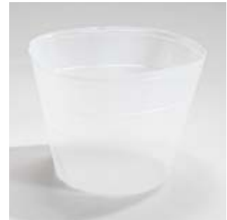
Kite moisture protection base for easy cleaning. Recommended for wet fractions like residual waste, compost and bottles/cans.

Kites design makes it possible to place in open areas or against a wall.