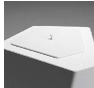
Kite lid insert in lacquered MDF, NCS S 0500-N, white.