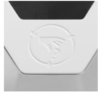
Milled symbols for different waste.