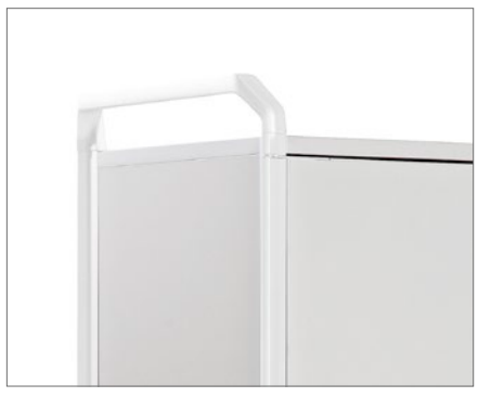
Handle moulded Aluminium for an easy Move