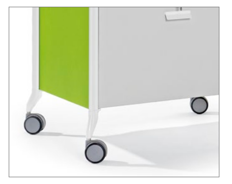
High quality castors (Lockable front castors de Ø 65 cm)