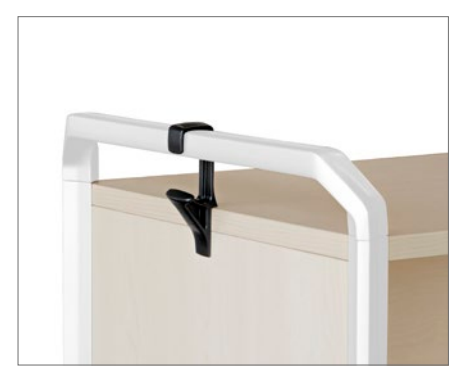
Coat Hanger de Polypropylene (P.P). To hang accessories