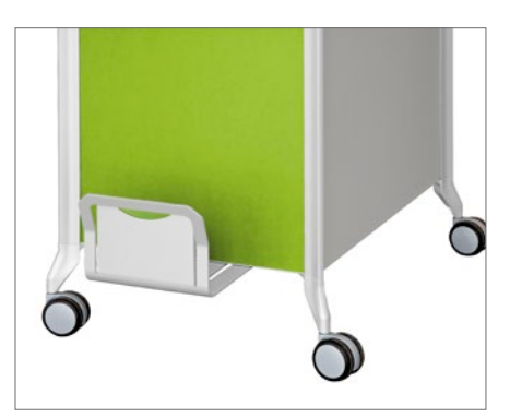
Steel briefcase holder extruded Steel 5 mm thickness (Optional)