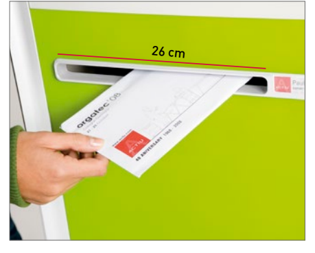
Letter box available on selected models 26 cm width and 2 cm high