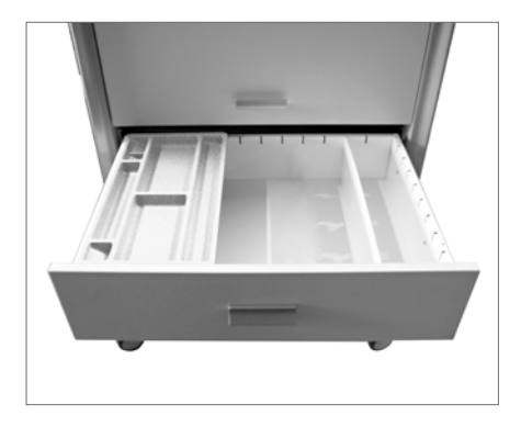
Drawers and filing drawer with mfc front panel and still inner. Divider and pencil tray included