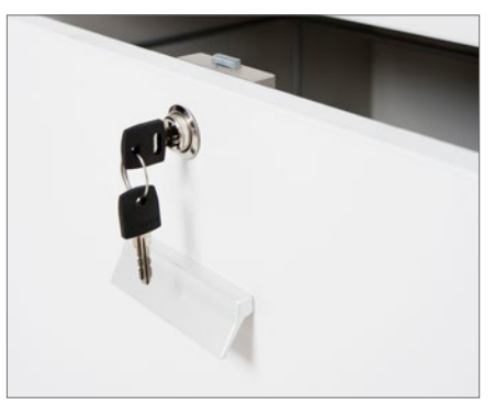
Door Handle Aluminium and lock