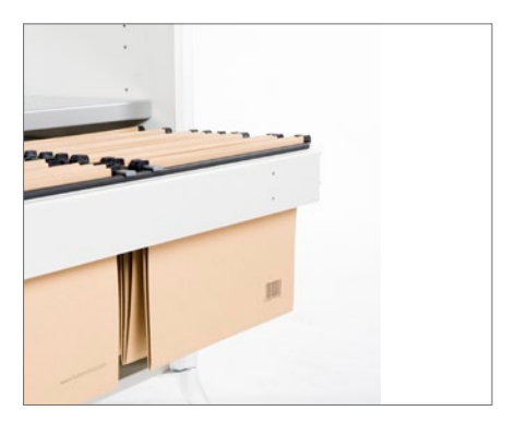
Optional Pull-put Drawer