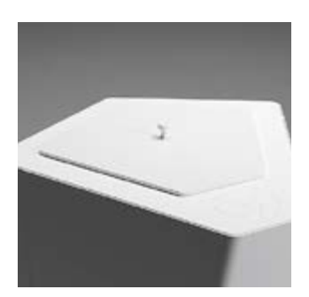
Kite lid insert in lacquered MDF, NCS S 0500-N, white.