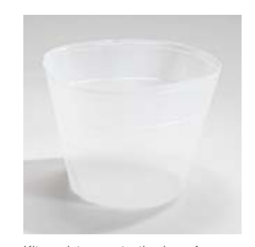
Kite moisture protection base for easy cleaning. Recommended for wet fractions like residual waste, compost and bottles/cans.