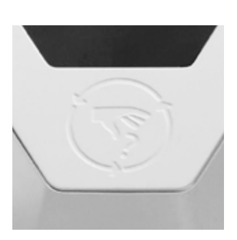
Milled symbols for different waste.

Note that the color reproduction in the catalog may differ from physical products.